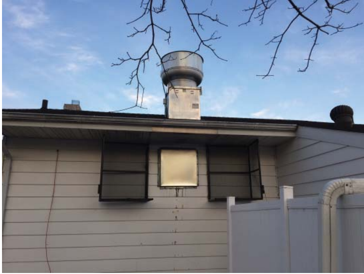
New Kitchen Hood Vent