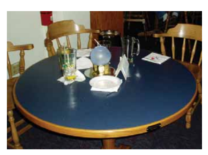
Hmm, what's wrong with this picture?