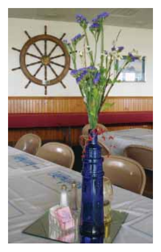
Beautiful New Centerpieces