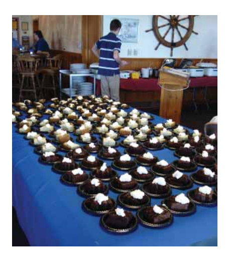
Desserts at Mother's Day Brunch