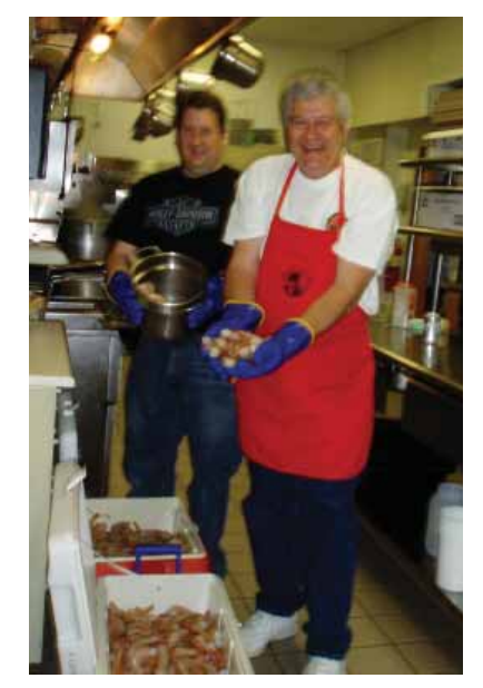
Shrimp Boil Stag Night