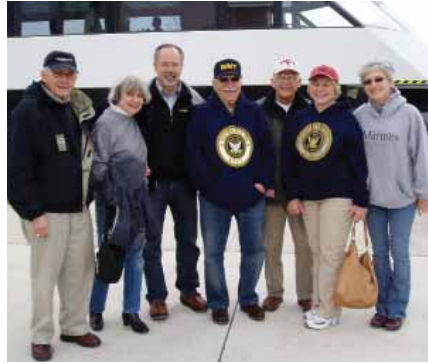
Foxy Lady Cruise

Membership keys are only to be used by the member. Spouses may not access the club alone.