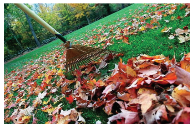
Volunteers Needed for Fall Clean-up; please help keep the grounds looking great!

If interested, please contact me or any Auxiliary member.